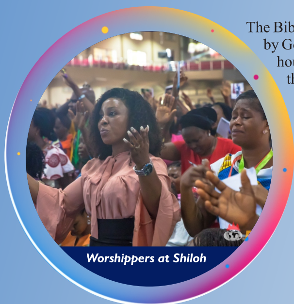
Worshippers at Shiloh

It is usually anchored by the Bishop, who leads and later allows the congregation to spend time alone in prayers to God. The significance of this aspect of the program is that it gives worshippers the opportunity to offer personal supplications to God.