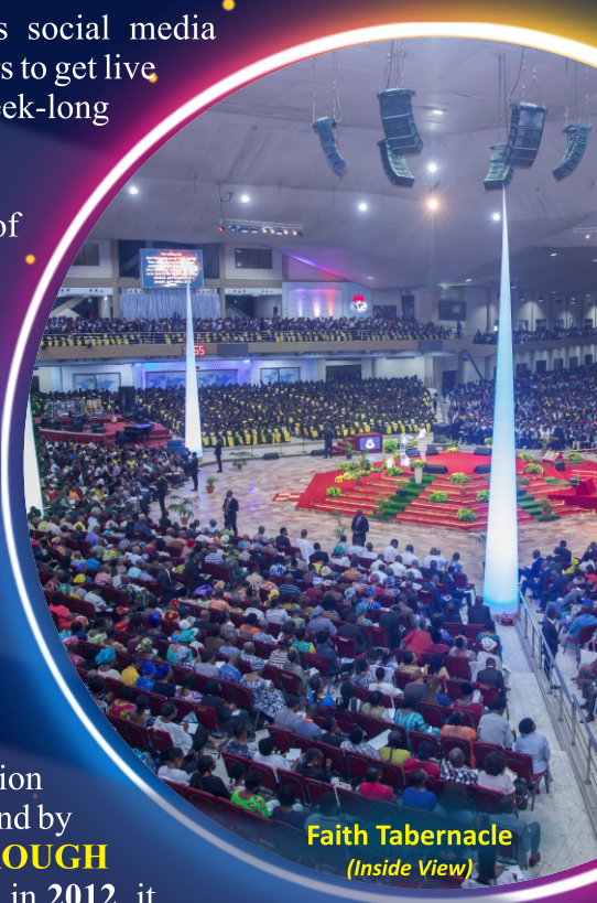
Faith Tabernacle (Inside View)

MY CASE IS DIFFERENT was tagged for the 2016 edition, while in 2017 , A NEW DAWN was beamed. Last year's edition, 2018, it was time to have DOMINION .