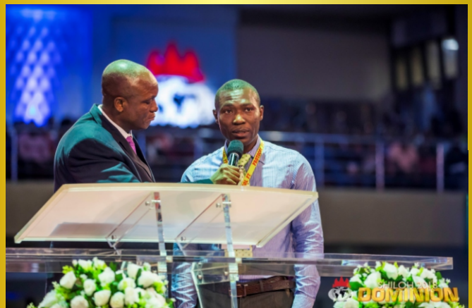
Testifiers at Shiloh

against me and in 2008, I was told to go on voluntary retirement. With prayers from Bishop Oyedepo, there was a declaration she would testify.