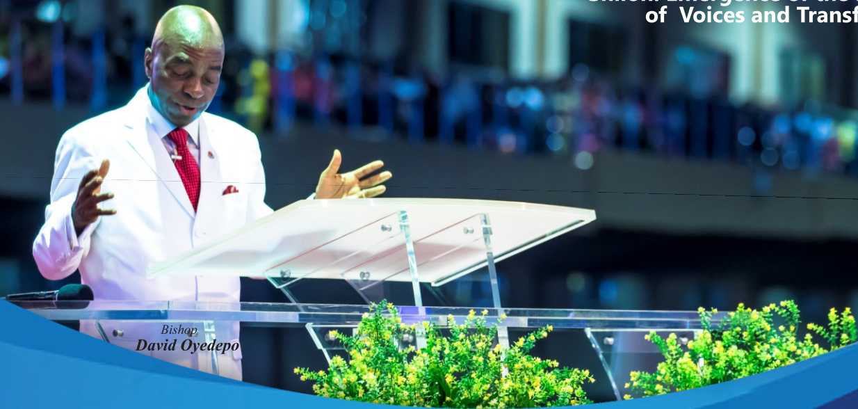
Bishop David Oyedepo

Without a doubt, David Oyedepo is a pastor of repute and he has stayed committed to the calling. The renowned pastor is appreciated as one of the pioneers of the Christian Charismatic Movement in Africa and one of the most powerful preachers in Nigeria.