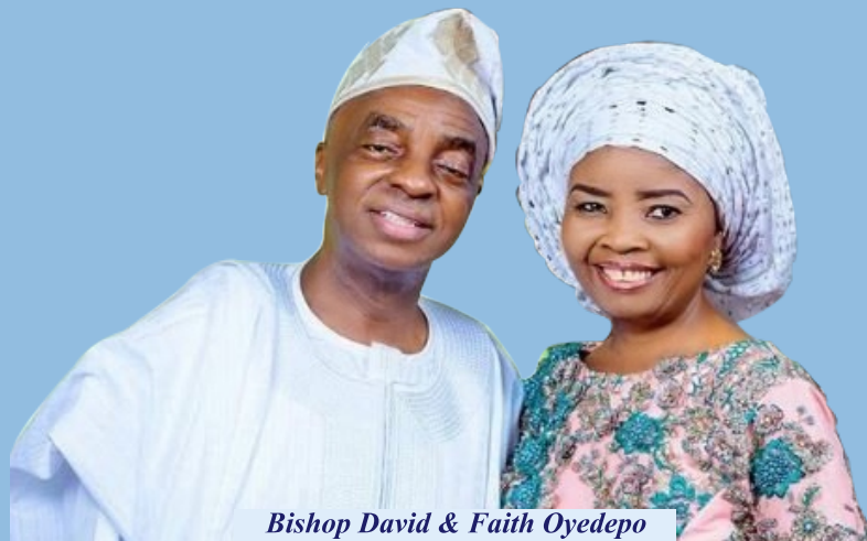
Bishop David & Faith Oyedepo

and the oxen for fifty shekels of silver”—2 Samuel 24:24. Sacrificial offering is one of God's ordained activities at Shiloh. It is an act of faith that draws God's attention in our direction at the speed of light. A good example is the attendant results that Solomon recorded when he sacrificed a thousand burnt offerings to God at Gibeon: “And the king went to Gibeon to sacrifice there; for that was the great high place: a thousand burnt offerings did Solomon offer upon that altar. In Gibeon the LORD appeared to Solomon in a dream by night: and God said, ask what I shall give thee.”- 1 Kings 3:4-5 .