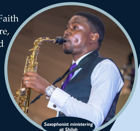
Saxophonist ministering at Shiloh

Indeed, everything about Youth Alive is youthful and eventful.