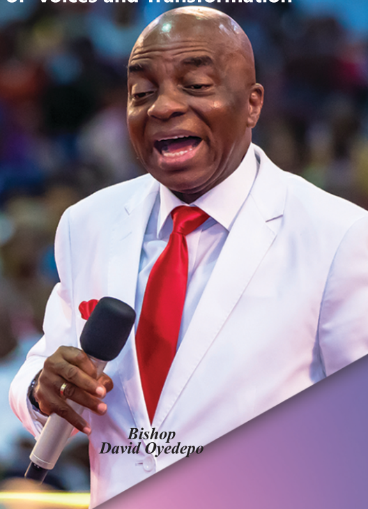
Bishop David Oyedepo

In the words of Bishop David Oyedepo, he has “always had a strange passion for God. I never knew it was going to be my lifetime assignment.” Born in Osogbo on September 27, 1954, the native of Omuaran, Kwara State is today recognized as a Christian luminary. He is an architect by training, a prolific author, preacher, founder and the presiding bishop of Living Faith Church Worldwide, also known as Winners' Chapel.