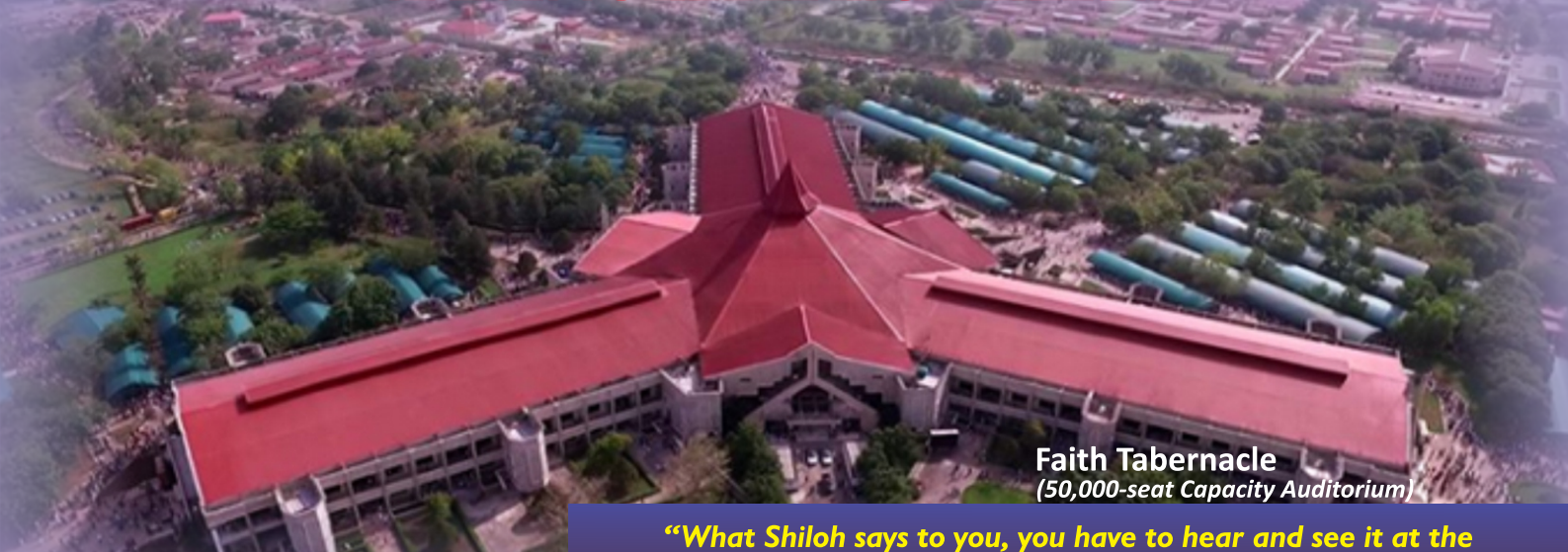
Faith Tabernacle (50,000-seat Capacity Auditorium)

“What Shiloh says to you, you have to hear and see it at the same time, for hearing without seeing and seeing without hearing makes for a wasted effort and an adventure in futility”