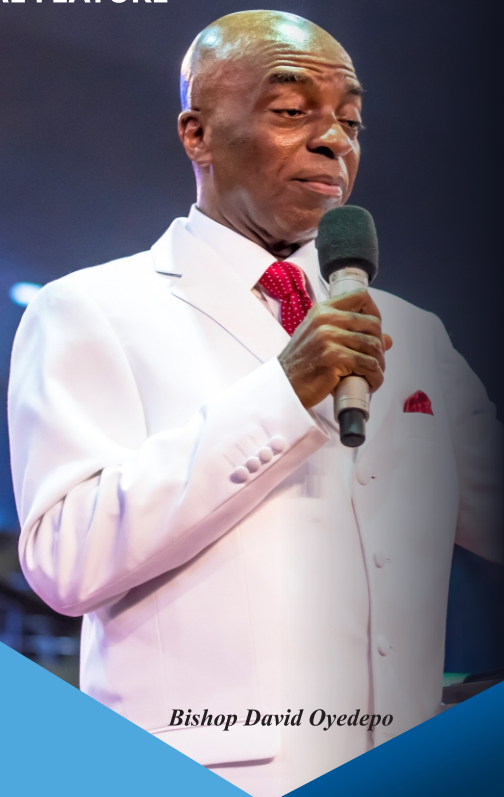
Bishop David Oyedepo

by which anyone can jump into the pool of water that is stirred annually by Shiloh himself that will come out dry.