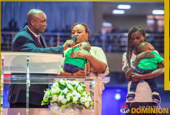
Testifiers at Shiloh

To God's glory in 2015, Honorable Iyabo Yerima , a high court judge from Ibadan said, “Sometime in 2007, I adjudicated over a case that did not go well with the government of the day. Series of petitions were written