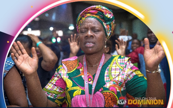
Woman in prayer

The congregation, during this session, prays on a list of raised prayer points and to the glory of God, all prayers are answered.