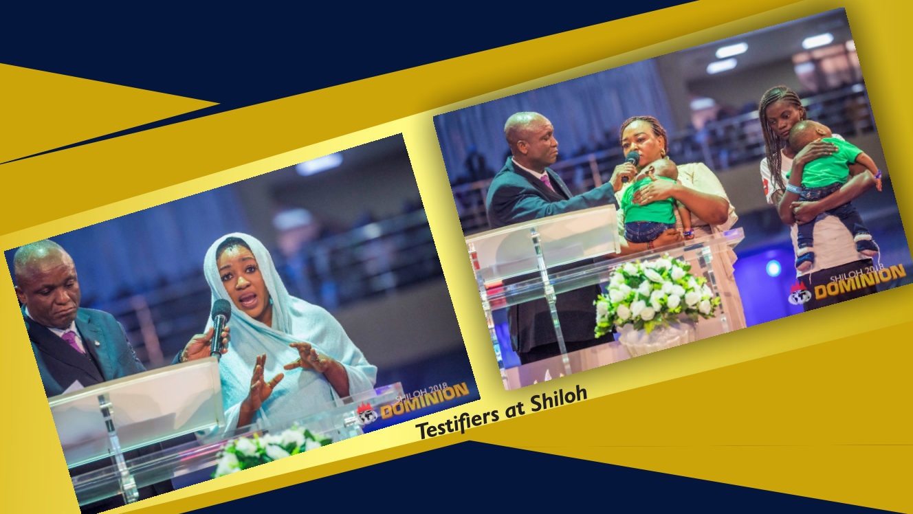
Testifiers at Shiloh

“I came in 2001 with six of my friends again all of them got married except me. I came in 2003 with 4, again all of them got married without me. I came in 2005 with another set, they got married without me.