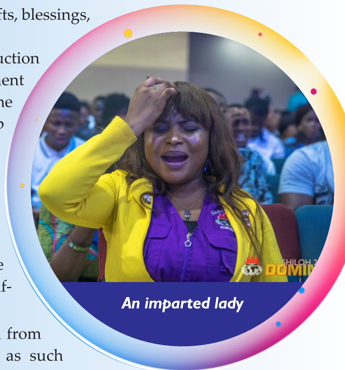
An imparted lady

Marriage is the coming together of a man and woman to become one in matrimony. Oftentimes, curses pose a threat to the survival of many marriages today. These curses, as well, are either self-inflicted or otherwise.