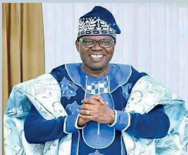
Evangelist Prof. Ebenezer Obey Fabiyi